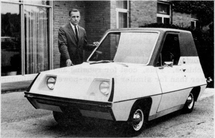
The General Electric Delta Car

pollution, it wouldn't spend the money for what was essentially a town car. So General Electric decided then was not the time for the electric automobile.