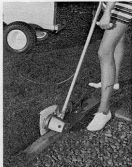
Electric edger makes yard care easy. Standard 115-volt tools can be used, too; you run them off an optional inverter.