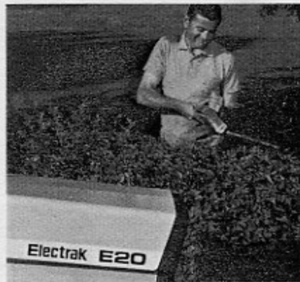
Electric hedge clipper, like other tools made for use with the tractor, impressed the author with its power and performance.