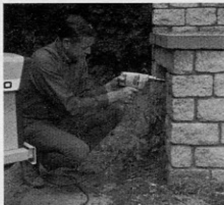
Electric drill, designed specially to run off Elec-Trak's 36-volt powerpack, lets you make repairs anywhere in your yard.