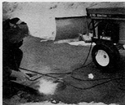
Potent DC welder operates so smoothly from the Elec-Trak's powerpack that even amateurs will be able to lay clean beads.

The "fuel" gauge. Once you get the feel of the Elec-Trak, take a look at the instrument panel. You'll see a "fuel level" gauge, which in reality indicates the level of the battery charge. A second gauge shows how much power you're pulling. Maybe