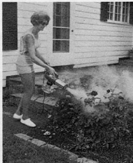
Garden fogger runs off the tractor's 36-volt powerpack, too. The low-voltage power system is well below the shock-hazard level.