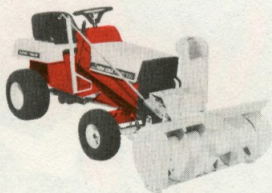
EGT-100 (10-hp Class) with 38" snow thrower.