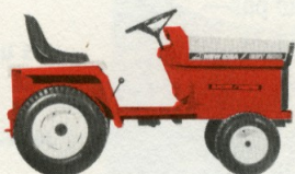
EGT-200 (18-hp Class) Electric Garden Tractor has 42" front- or mid-mounted mower.

Rugged, long-lasting Power Pack Cells —Powerful, long-lasting, rechargeable Power Pack Cells provide power to let you mow from 1-to-4 hours or more (depending upon the model you own). And when it's time to recharge, plug into any grounded household outlet. A few pennies worth of electricity brings 'em back to life! Full powered!