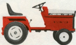
EGT-150 (16-hp Class) with front- or mid- mounted 42" mower.