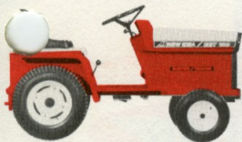
EGT-120 (14-hp Class) mows 42" swath with front-mounted mower.

(In addition to the two shown above, the following are also available.)