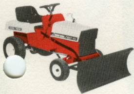
EGT-80 (8-hp Class) with 42" snow blade.

Cordless battery power! Wait'll you see a New Idea Electric Tractor man-handle the biggest snow drifts around. There's a 42" snow/dozer blade for the EGT-80 (8-hp Class) and EGT-100 (10-hp Class) tractors . . . a big 48" blade for the EGT-120 (14-hp Class), EGT-150 (16-hp Class), and EGT-200 (18-hp Class) models. There's also a 42" wide snow blower for the EGT-120 and larger models.